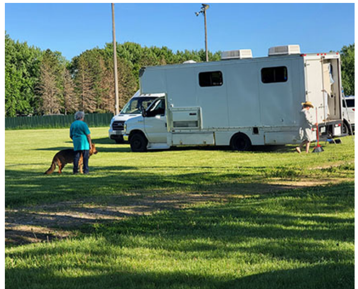
Red and the weird stranger