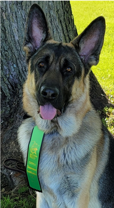
Circa passed his temperament test. Steffca V Lindenhill Sin City CGC CGCA TKN TC