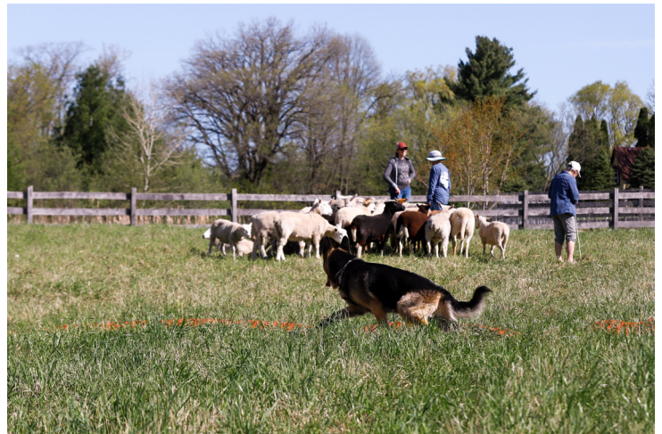
Angus on the large graze