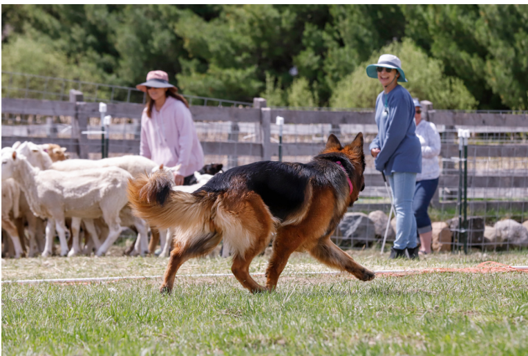
Wilhelmina on the graze