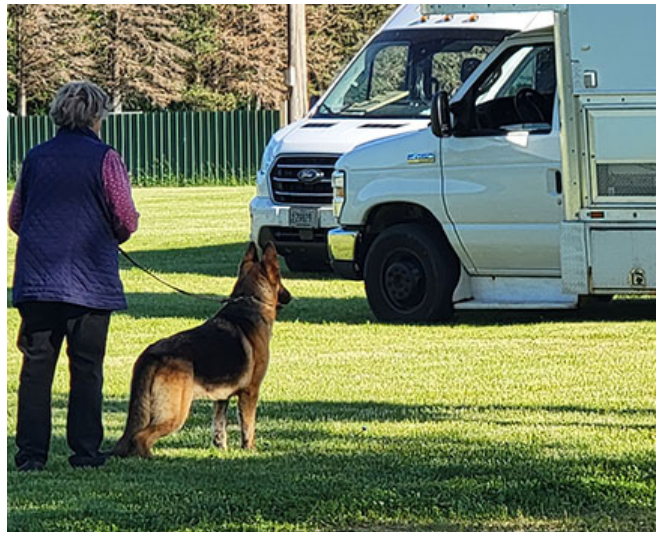
Virginia and the weird stranger