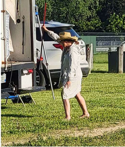
The weird stranger