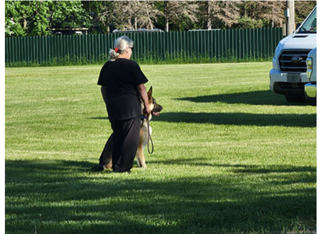
Circa and the weird stranger who is out of camera range