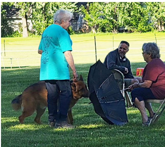
Red and the umbrella